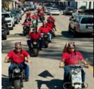
Great way to start the parade