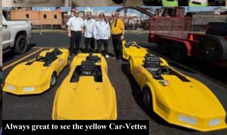
Always great to see the yellow Car-Vettes