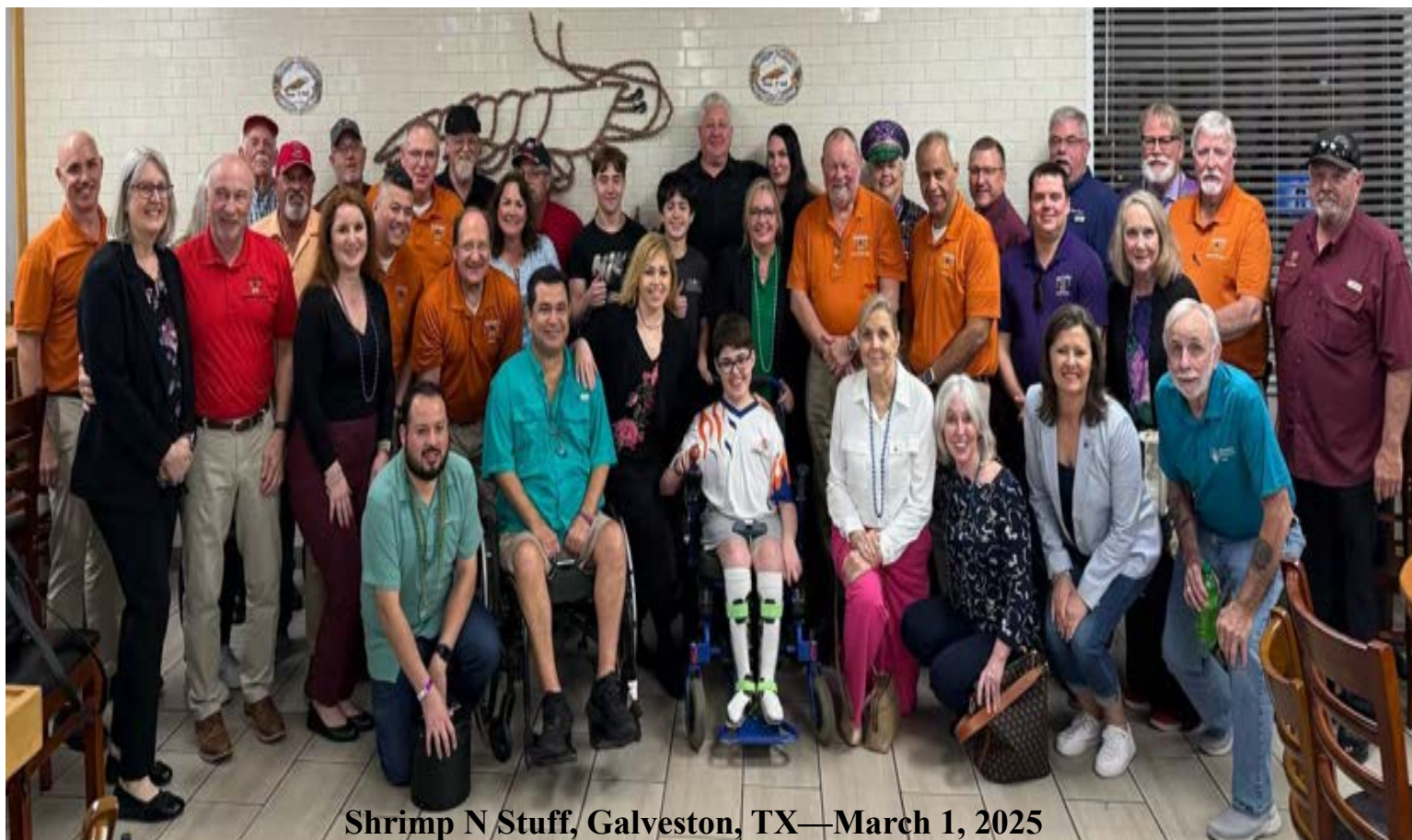
Shrimp N Stuff, Galveston, TX—March 1, 2025