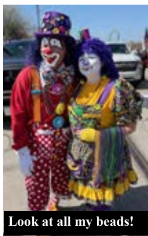
Look at all my beads!

The office of Philanthropy will host a Walk for Love Fundraising event on November 15th. The one-mile walk will begin at the hospital, pass through the historic East End of Galveston, and conclude back at the hospital. Afterward, we will host a carnival in the green space and parking lots behind the hospital, featuring fun activities for kids, including face painting, balloon animals, games and more. The primary goals of this event are to raise awareness of our services in the community, build corporate support, and generate funds for the hospital.