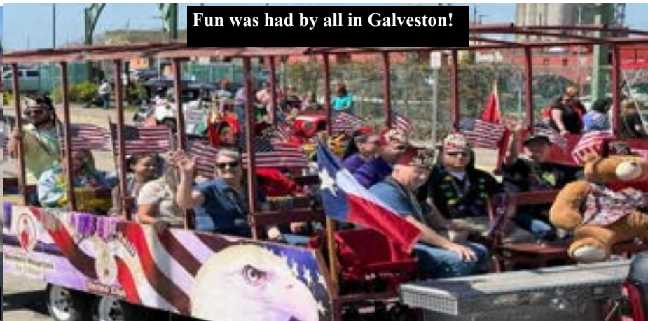
Fun was had by all in Galveston!