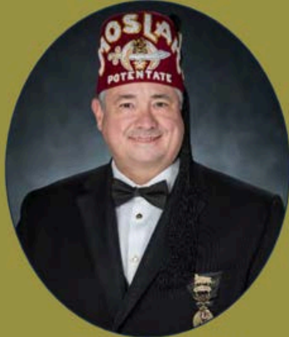
POTENTATE 2024 COTY OWENS