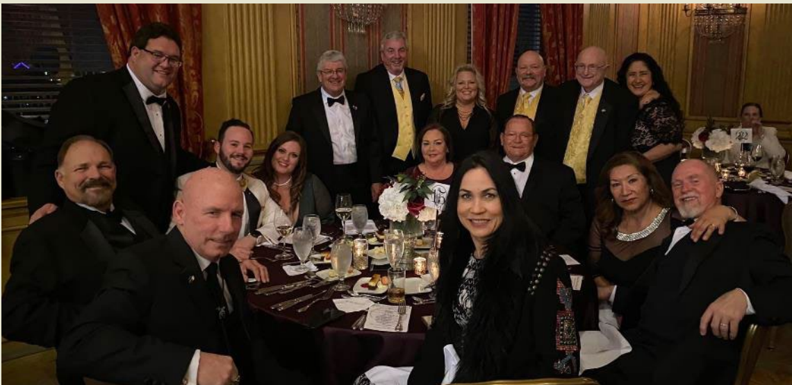
A good time was had by all Car-Vettes at the Potentate Ball