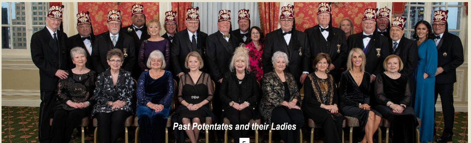
Past Potentates and their Ladies