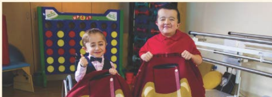
TOUR SHRINERS CHILDREN'S TEXAS HOSPITAL