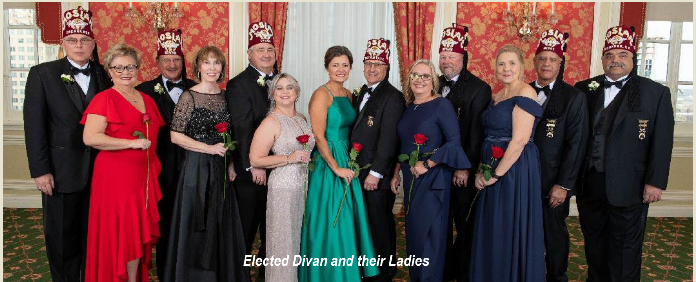
Elected Divan and their Ladies