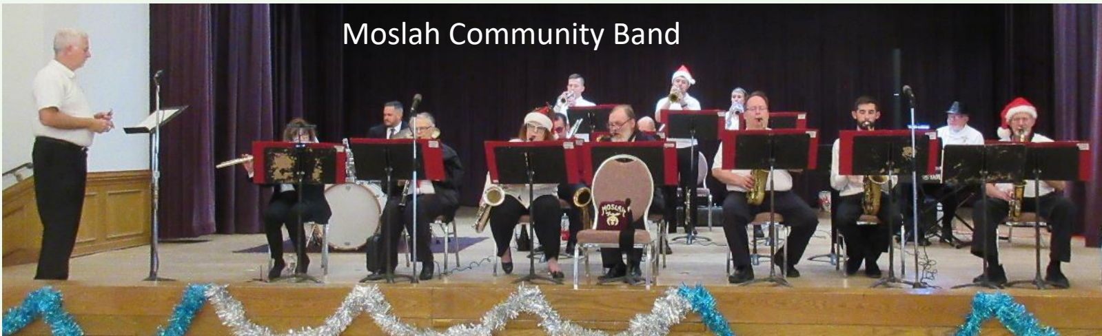
Moslah Community Band

Questions: Moslah Shrine Office 817-335-9469