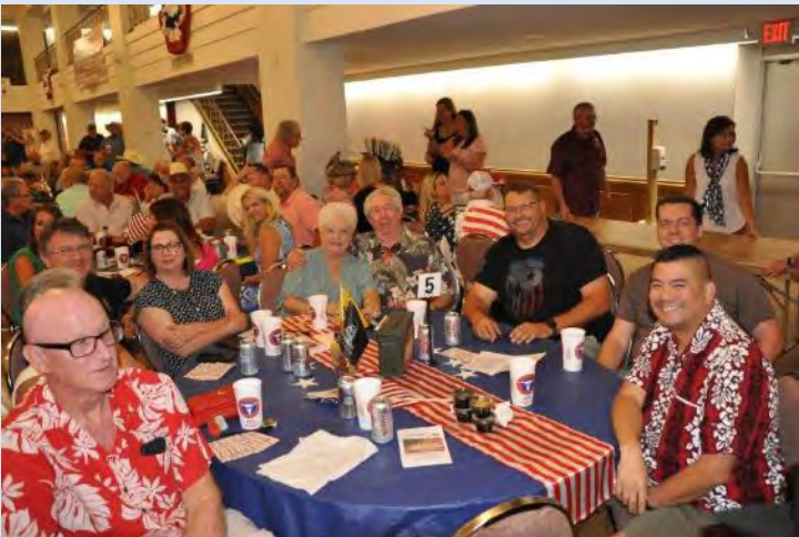
Mystic Wheels' nobles and their ladies