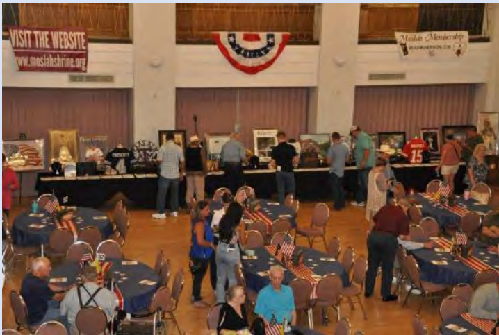
Lots of sports memorabilia, jewelry, and vacation trips were available in the Silent Auction

The Temple Ballroom was packed on Saturday, August 13, 2022 for the 11 th Annual Moslah Shrine Sportsman Spectacular. There were over 450 people in attendance who enjoyed the patriotic-themed night. Risky's provided a delicious barbecue dinner, and many participants went home with new silent and live auction items.