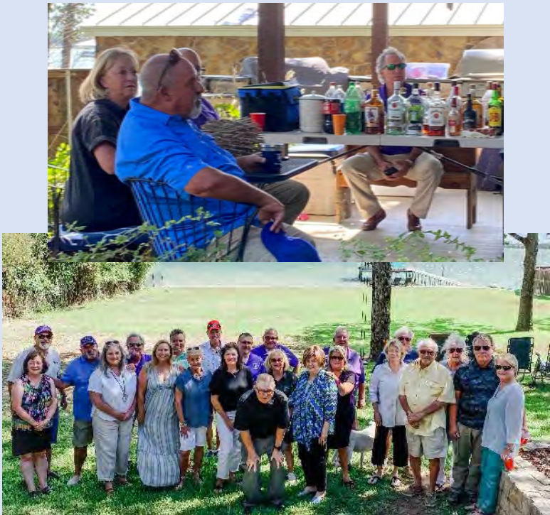
Golf Unit Circus Ad Sales Kick-off Party in August