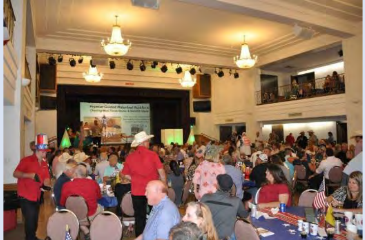
Attention turned to the stage for the Live Auction where several hunts were auctioned off as well as tickets to see George Strait in Las Vegas