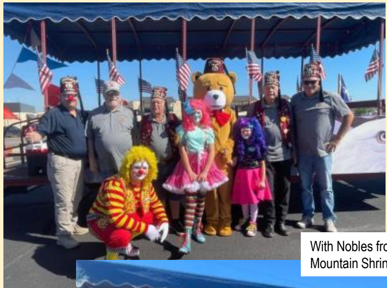
With Nobles from Eagle Mountain Shrine Club