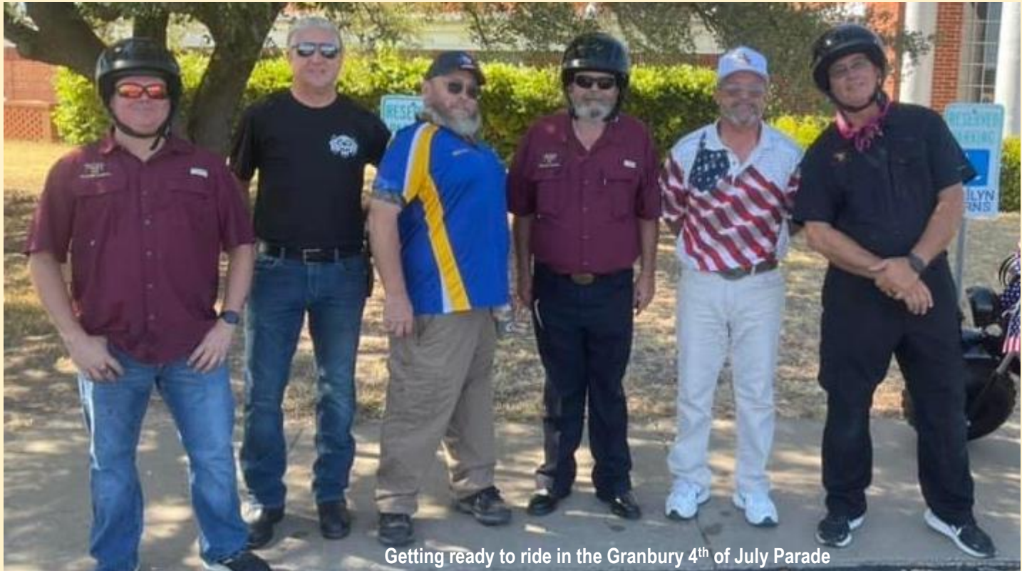
Getting ready to ride in the Granbury 4 th of July Parade

We are looking forward to smashing the record at Obstacle in August!