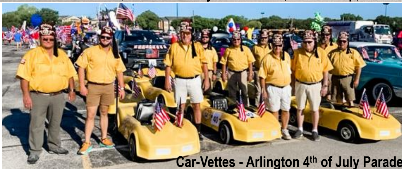
Car-Vettes - Arlington 4 th of July Parade

Eagle Mountain Shrine Club, Lake Granbury Shrine Club, Motor Corp, and Clowns