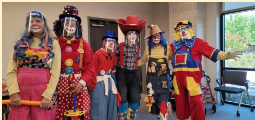
Even clowns wear masks during this Covid pandemic!