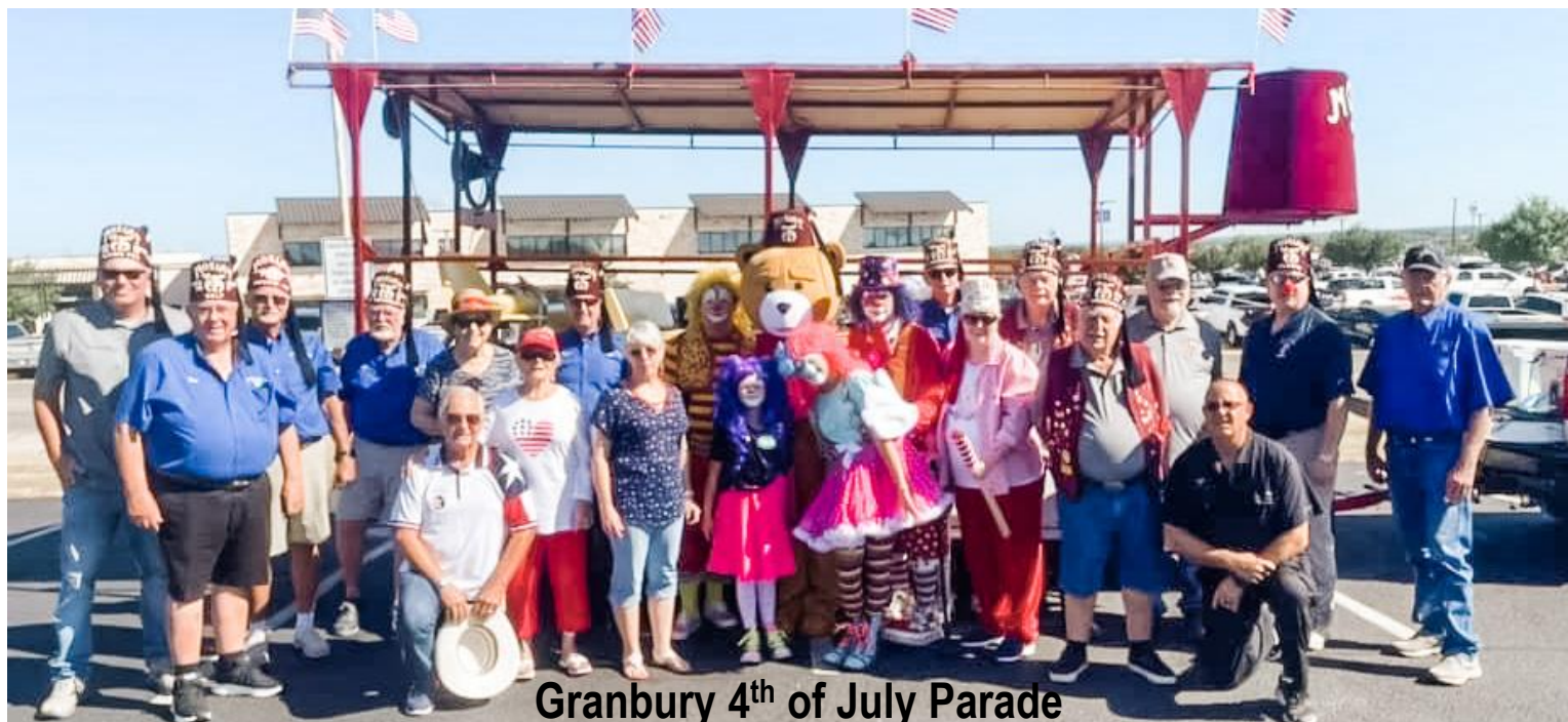
Granbury 4 th of July Parade

Eagle Mountain Shrine Club, Lake Granbury Shrine Club, Motor Corp, and Clowns