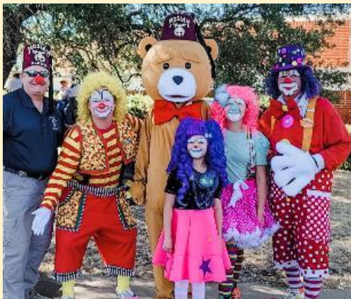
Granbury 4 th of July Parade