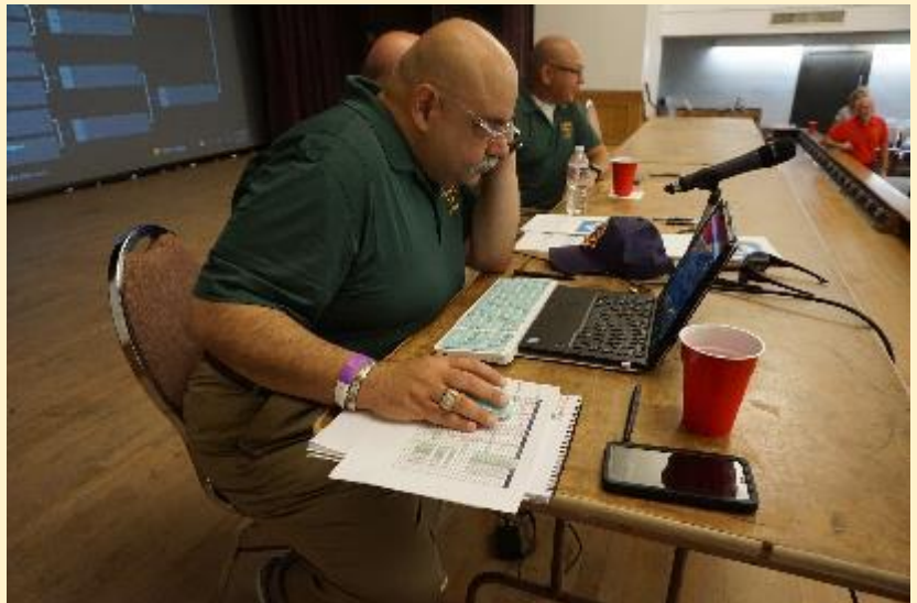
Things got serious as the number of teams whittled down.