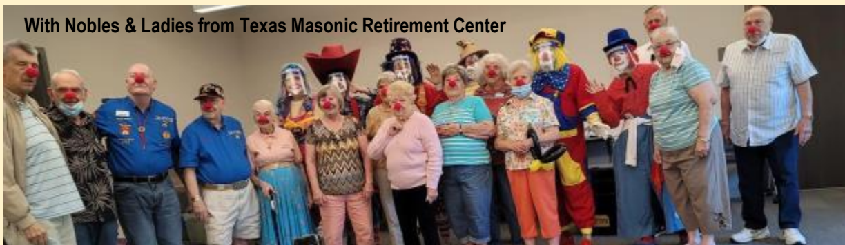
With Nobles & Ladies from Texas Masonic Retirement Center