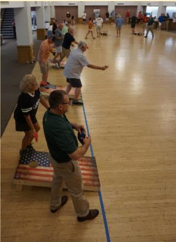
It was very loud in the Ballroom with all of the bags banging the boards at once

Click here for more Cornhole Tourney Pics