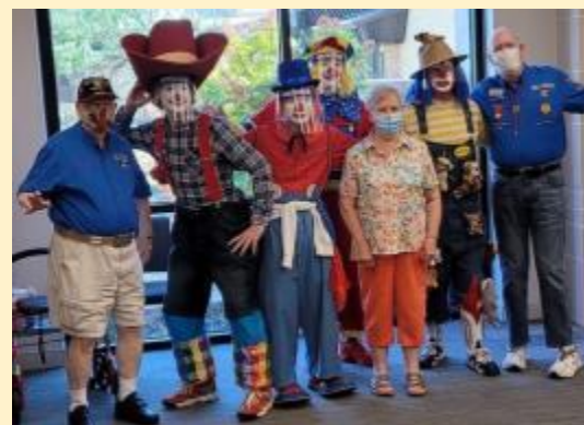
Visit to The Waterford Retirement Center