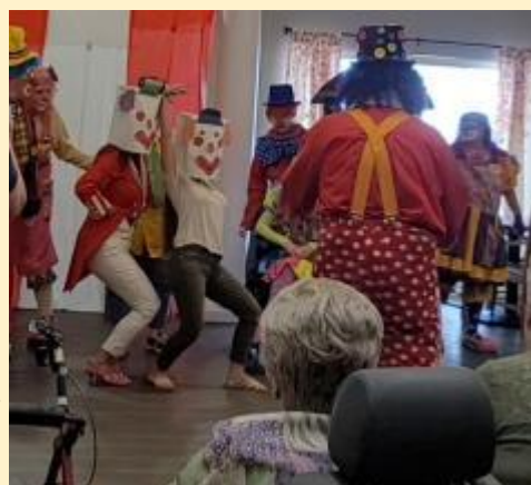
Residents & staff get in on the clown skit →