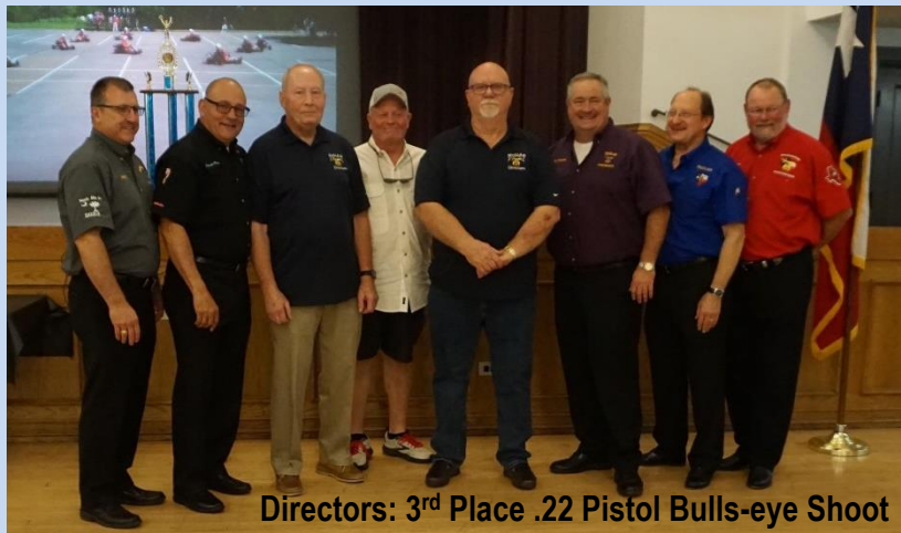
Directors: 3 rd Place .22 Pistol Bulls-eye Shoot