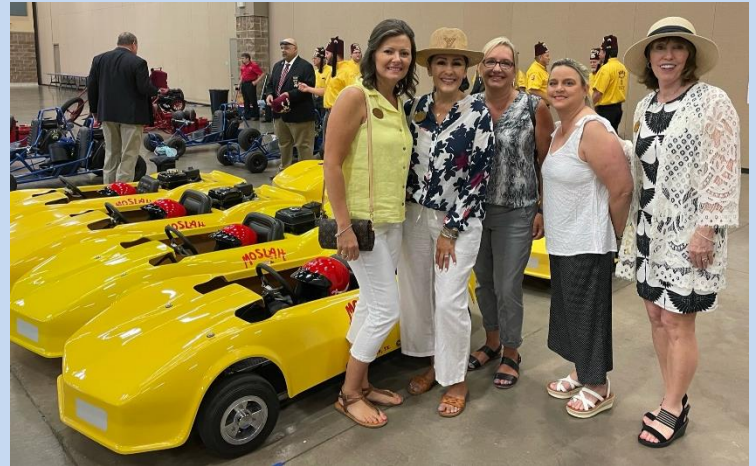
Divan Ladies shopping for their next cars