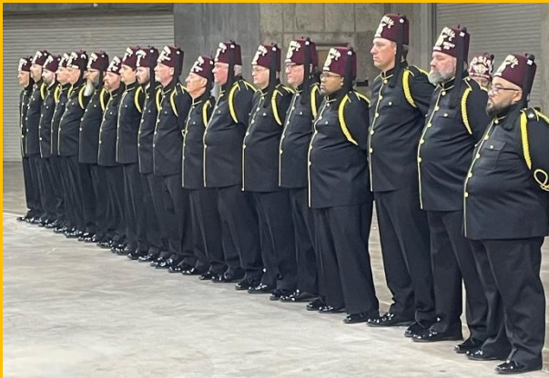
...But the pre-drill Inspection was very tense.