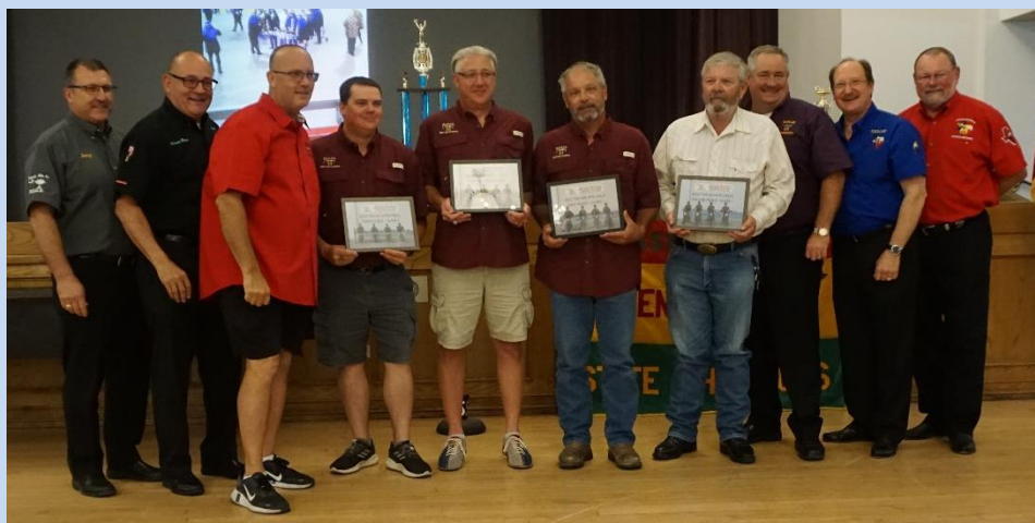
Motor Corp (Class I): 1 st Place WEEE A, 2 nd Place 500's, 3 rd Place WEEE B, plus 2 Wheel Overall High Points - WEEE A