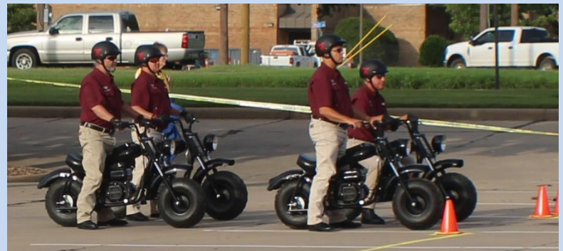
Motor Corp waiting to take to the pad