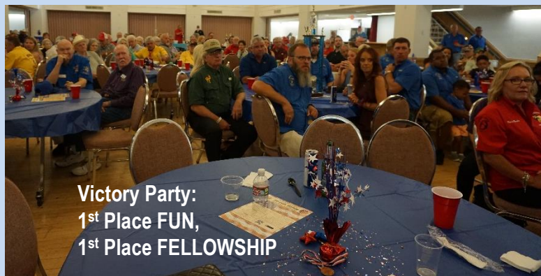
Victory Party: 1 st Place FUN, 1 st Place FELLOWSHIP