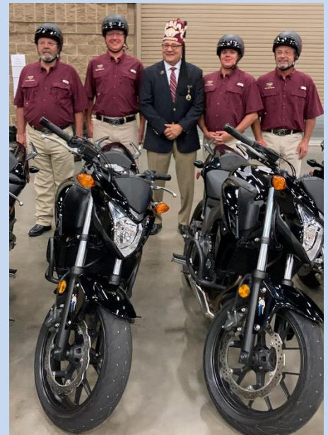
Motor Corps 500s with Illustrious Sir Reyes