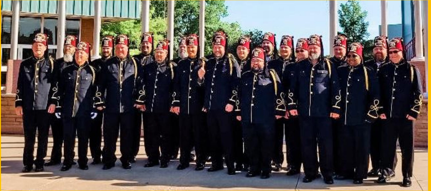
The Solid Gold Patrol was all-smiles after their successful drill.