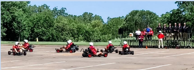
Mystic Wheels performing their drill. The Divan observes from the Judges Platform.