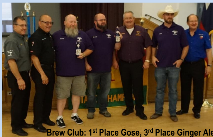
Brew Club: 1 st Place Gose, 3 rd Place Ginger Ale