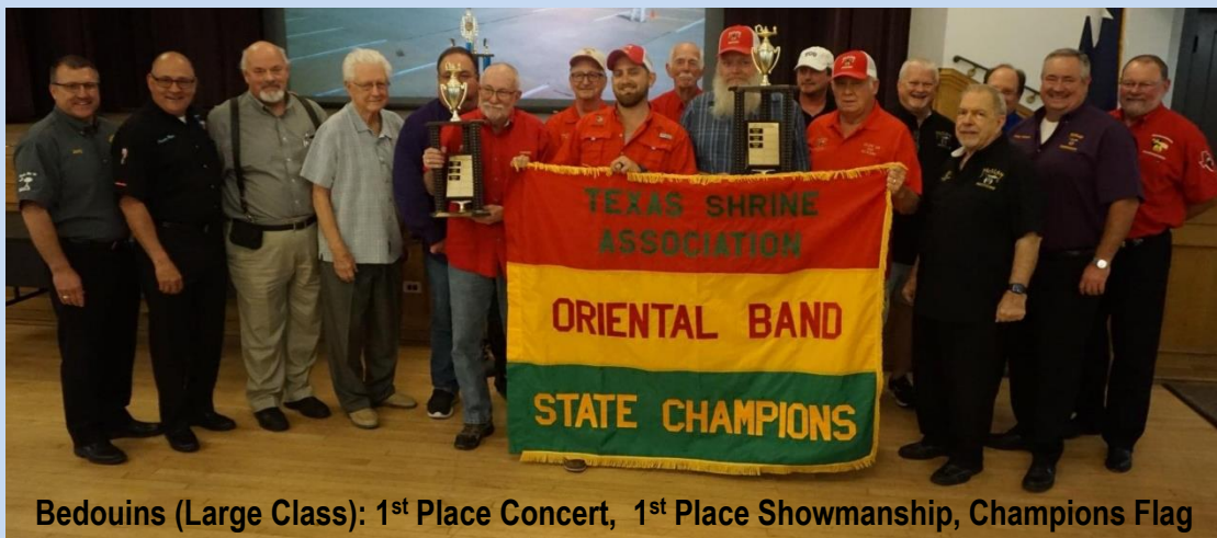
Bedouins (Large Class): 1 st Place Concert, 1 st Place Showmanship, Champions Flag