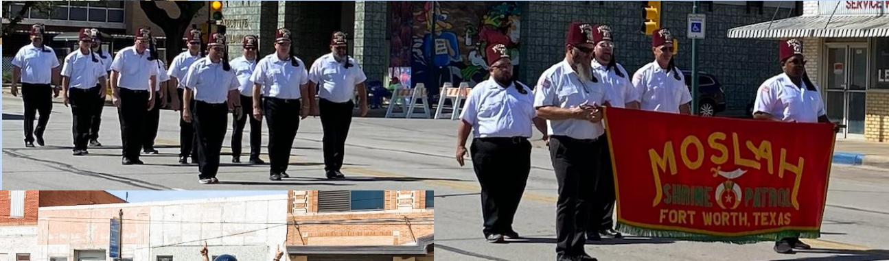
Lining up for the Parade