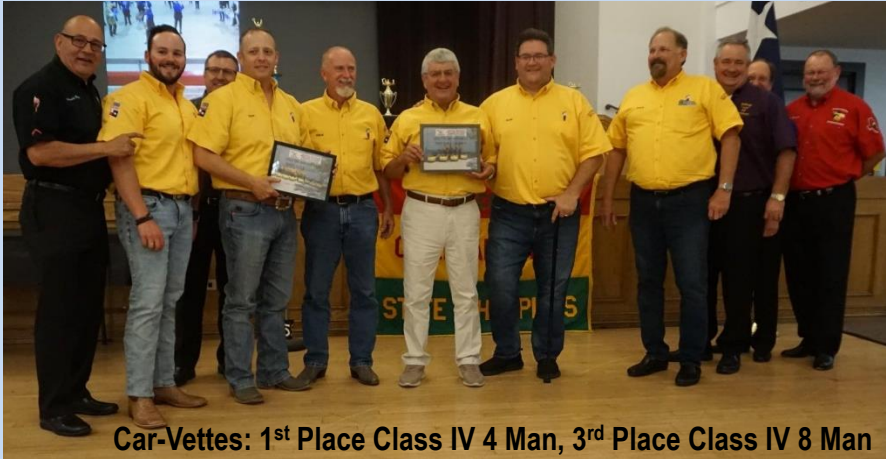
Car-Vettes: 1 st Place Class IV 4 Man, 3 rd Place Class IV 8 Man