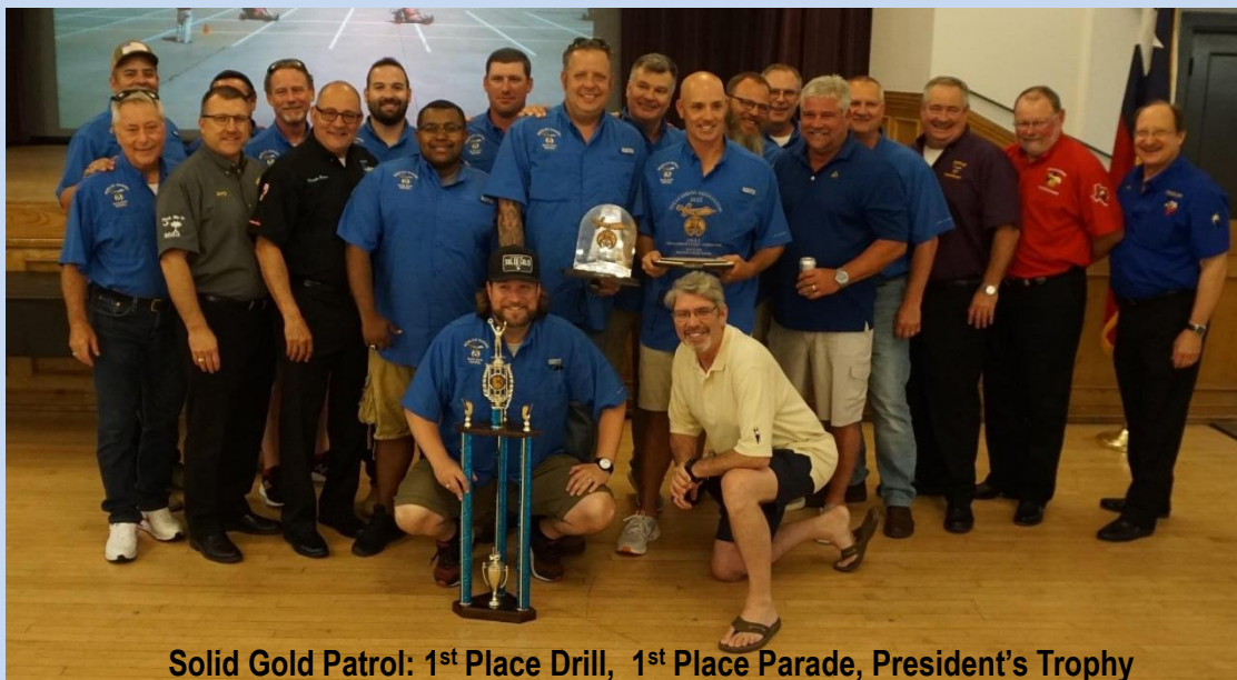
Solid Gold Patrol: 1 st Place Drill, 1 st Place Parade, President's Trophy