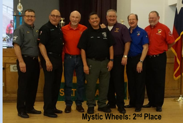
Mystic Wheels: 2 nd Place