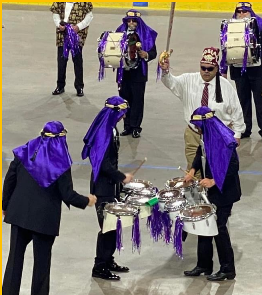
The drums were really banging it and the camels were really humping it!