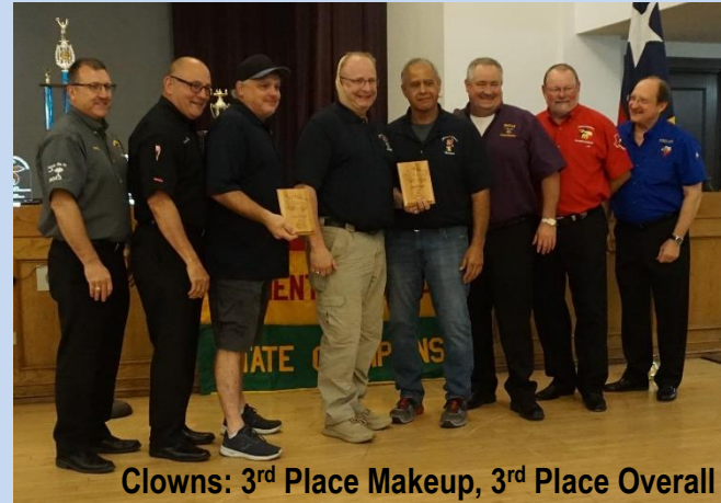
Clowns: 3 rd Place Makeup, 3 rd Place Overall