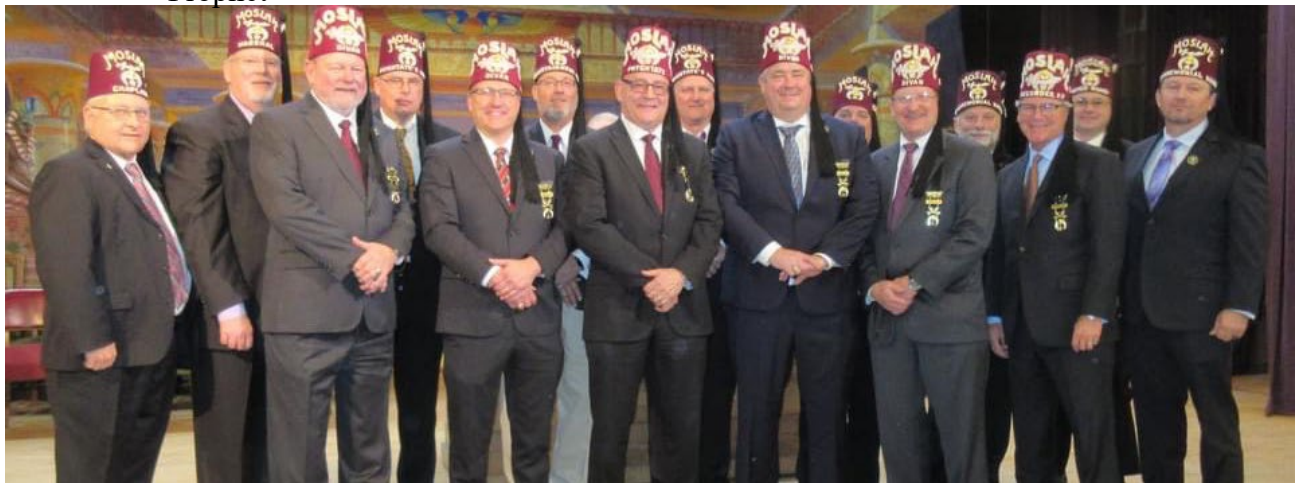
Elective and Appointive Divan