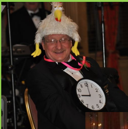
Oriental Guide with treasured chicken hat