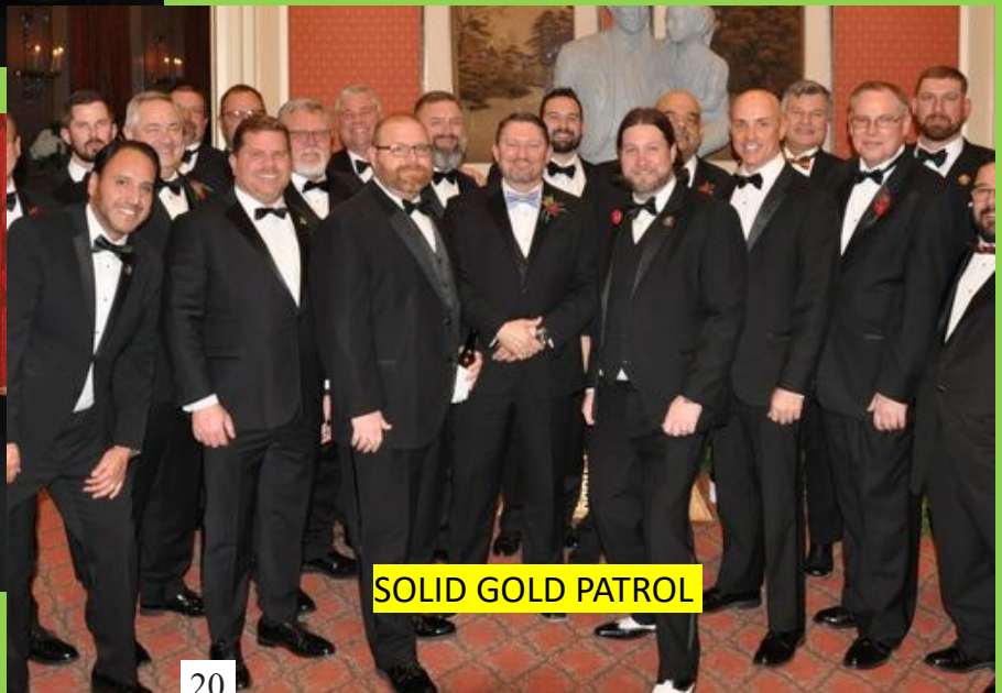
SOLID GOLD PATROL