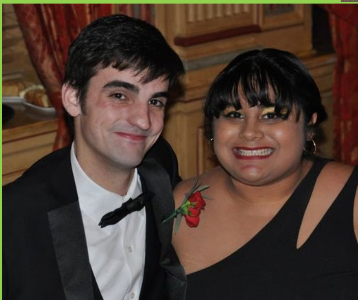
Daughter and guest of the new Oriental Guide