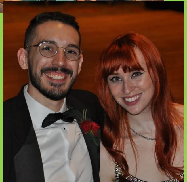
Daughter and guest of the new Oriental Guide