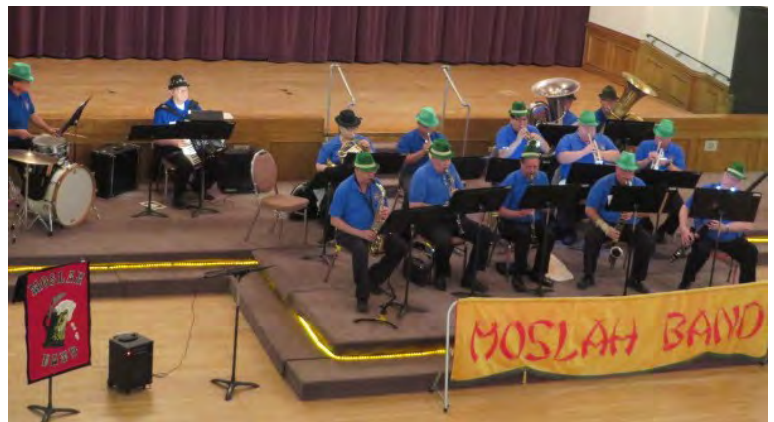
Band Concert March 12th which featured the German Band Music