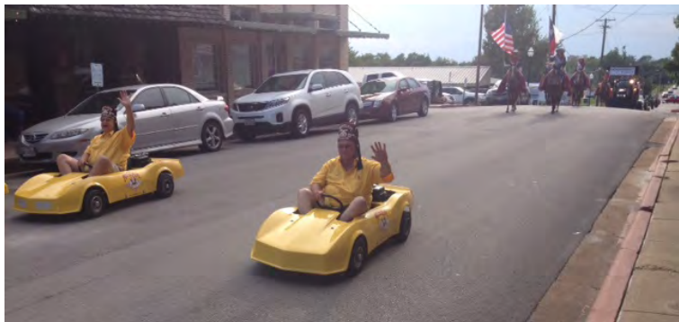
Chisholm Trail Rodeo Parade in Decatur: