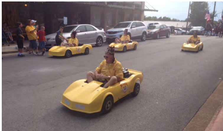
Chisholm Trail Rodeo Parade in Decatur: