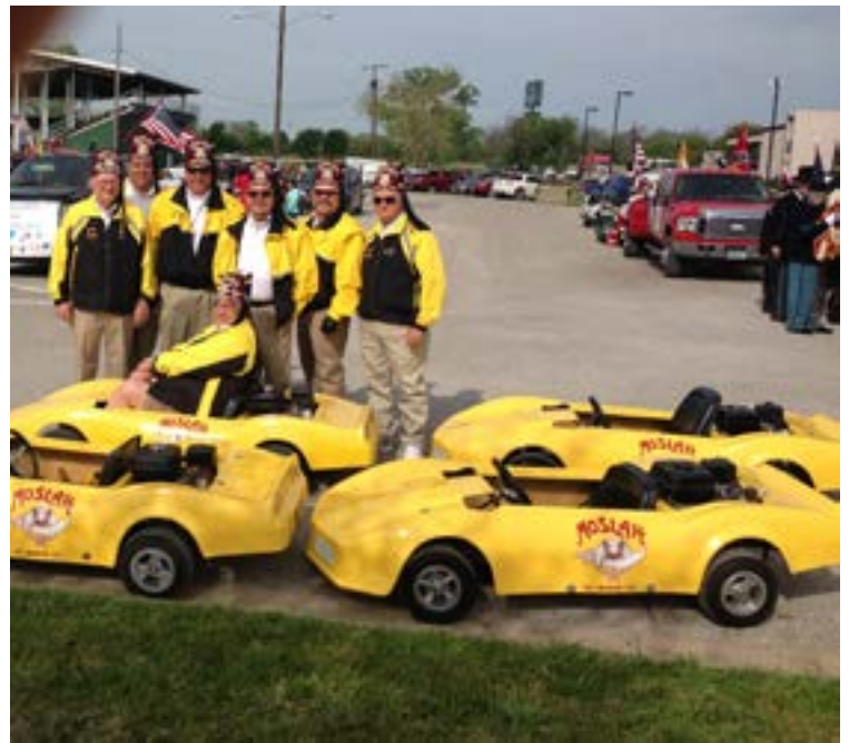
Moslah Car-Vettes at the Gainesville, Texas Medal of Honor parade in Gainesville on Saturday, April 22, 2015.

The city of Gainesville holds this parade every year to celebrate Americas living Medal Of Honor veterans. This year there were 19 Medal of Honor vets. present.