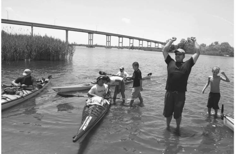
The firefighters finished their 1,000-plus mile journey up the Atlantic Intracoastal Waterway on June 24. Their trip raised more than $20,000 for Shriners Hospitals.